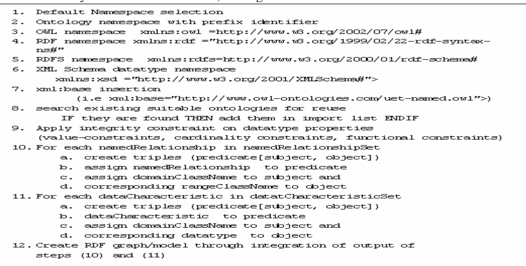
Figure 2: Ontology design in pseudo-form

b) Resources identification and grouping in term of classes: RearchGroup: There may be number of research groups, each has a URI, so these are grouped