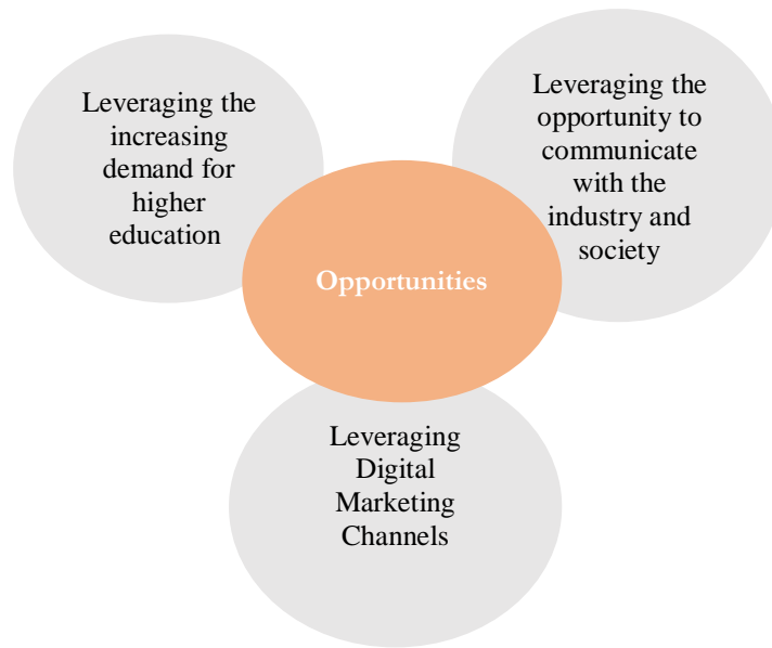
Figure 1: Opportunities of higher education marketing in Iraq

The opportunities identified in this research underscore the potential for higher education institutions in Iraq to enhance their marketing efforts and position themselves for success in a competitive landscape. By capitalizing on the increasing demand for education, fostering collaboration with industry and society, and leveraging digital marketing channels, institutions can differentiate themselves, attract top talent, and drive positive outcomes for students, stakeholders, and the broader community. According to AHP results, leveraging the increasing demand for higher education in Iraqi experts opinion is in the first priority. It means that there is an emergent educational market in Iraq. At the other hand, Cultural and Social Challenges, is the most important challenge among other ones. Maybe the traditional structure of Iraq society can make some difficulties in this way for demanders.