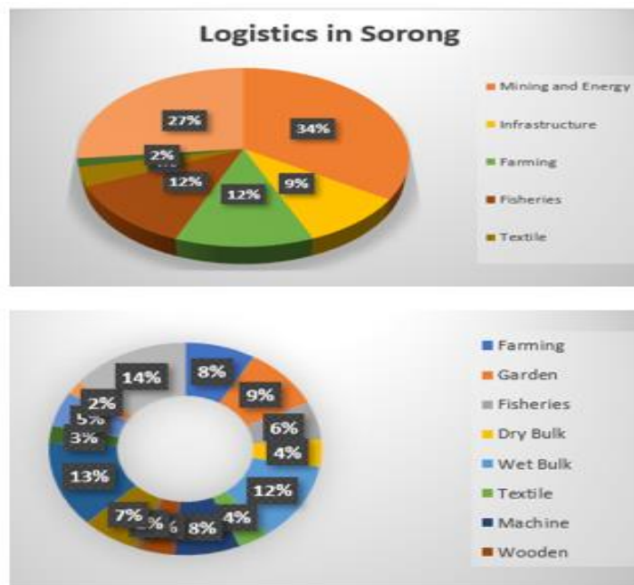
Figure 3. The Types of Commodities in Sorong Port