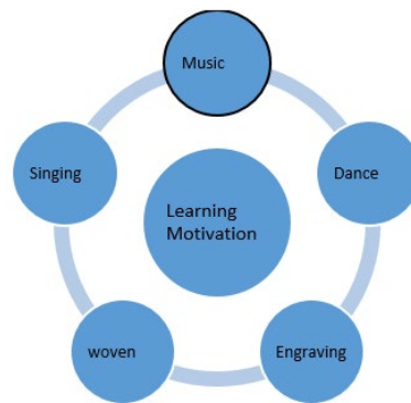
Figure 2: Arts-Based Edutainment Learning Model to Increase the Level of Learning Motivation among the Orang Asli Primary School Students

Based on the data obtained through interviews with the Orang Asli community, teachers, and students, as well as field observations, a learning model based on arts-based edutainment has been developed. This model aims to increase learning motivation among Orang Asli students in Malaysia. The diagram below shows the Arts-Based Edutainment Model that has been developed.