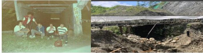
Figure 4: The renowned Uventira Bridge is believed to be haunted

Uventira is characterized by the prominent abundance of diverse species of towering trees and a bridge reputed to grant visibility to supernatural phenomena exclusively. The bridge (Fig. 4) serves as the gateway to the enigmatic realm of Uventira. The belief in the existence of supernatural beings or spirits is pervasive in several civilizations, both in their cultural practices and daily lives. The people of Central Sulawesi possess a profound belief system rooted in narratives and myths concerning the presence of spirits and otherworldly entities.