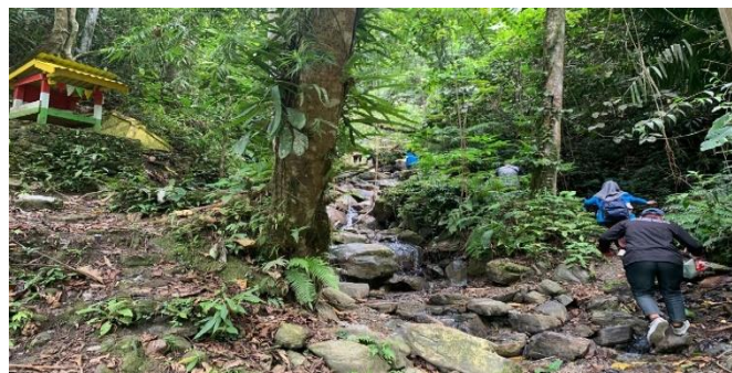
Figure 2: Walk alongside the river's edge beyond the boulders

The Uventira area is exquisite woodland imbued with an authentic natural ambiance, nestled within the picturesque highlands of coffee plantations. The scene is characterized by a sense of chill, with towering trees and bushes lining the rugged river. Initiating the expedition to the enchanting urban region of Uventira necessitates tracing the course of the river (Fig 2). To reach the destination, navigate through the dense foliage and rugged terrain amidst towering, shadowy trees. In addition, you have the option to traverse the riverside, navigating around boulders, ascend precipitous peaks, and maneuver through dense foliage. According to the custodian of Uventira, the supernatural entities residing in the region have an aversion to large gatherings, despite the potential of the pool to become a prominent attraction for tourism.