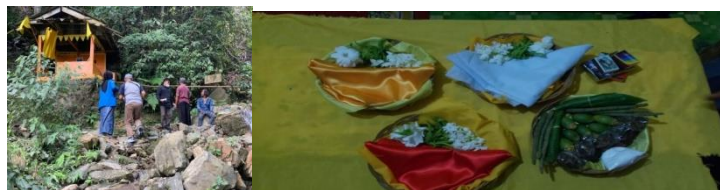
Figure 5: Dwelling or small structure used for storing offerings or sambulu

Visitors consistently visit the meditation house or hut. The dwelling or offering (Fig. 5) hut is adorned with yellow fabric. The color yellow is commonly associated with Uventira and holds a significant spiritual significance, symbolizing the hallowed nature of the land and its abundance of captivating narratives. In addition, Uventira upholds the significance of two more hues: red, symbolizing courage, and white, symbolizing purity and sanctity.