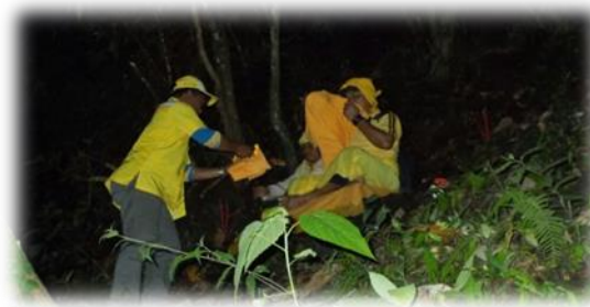
Figure 3: Depicting the act of summoning spirits through a ceremonial process

Uventira is a forested region within a coffee plantation that is believed to possess supernatural abilities (Fig 3). Consequently, individuals who enter or engage in activities within this area are required to perform specific rituals beforehand. The dialogue ritual serves as the initial stage of a conventional ritual that paves the way to the realm of the supernatural. The purpose of the ritual is to establish communication with spiritual entities or spirits for the purpose of seeking advice, requesting assistance, or attaining specific spiritual objectives. The mantra sound that references "uventira" is as follows: "Himo ngena pobawayaka kami Kana raepe miu." This indicates that this location possesses extraordinary abilities. Enter the room, please. The phrase "Makava ledo" does not have a clear meaning or context. Nemo The bird perched on a branch, displaying its dignity and elegance. Topoulana, totua, and umbamo pura tomanuruna Simo is feeling incredibly exhausted. This is our delivery, often known as a presentation. It is imperative that you remain attentive. Do not arrive at a later time, Satan, who originates from Kulawi, boasting, and Gohira. Where have you departed, all you revered individuals, forebears, and malevolent beings? Participate in our upcoming event organized by Gazali et al. in 2023.