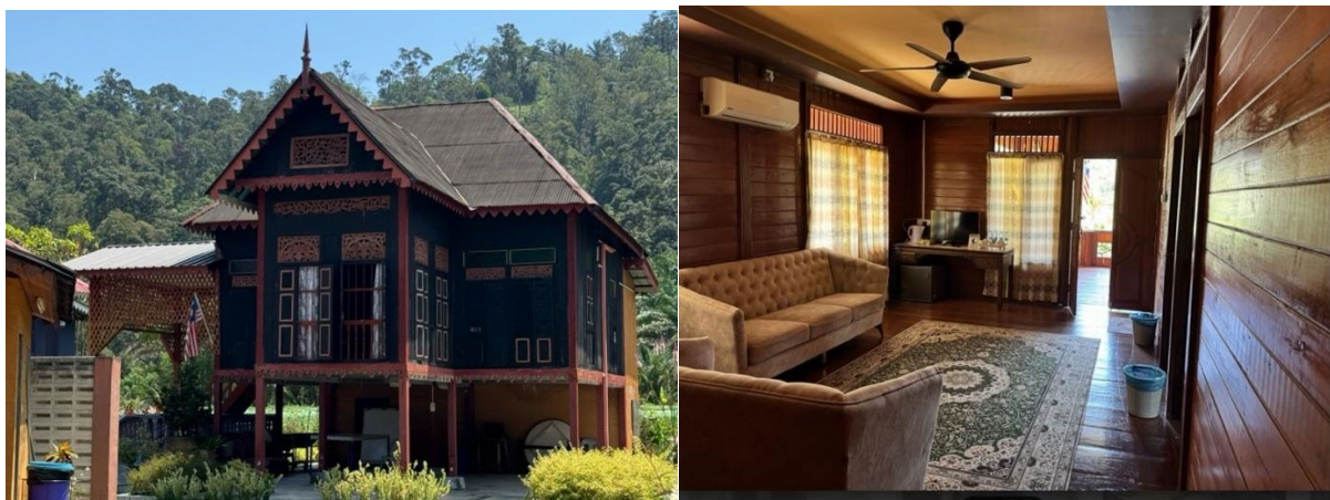
Figure 2: Homestay Relau

Through these practices, Islamic homestays provide visitors with a unique opportunity to engage with Malaysian culture and Islamic traditions, fostering greater understanding and appreciation among guests. Figure 2 represents the Malay concept of homestay.