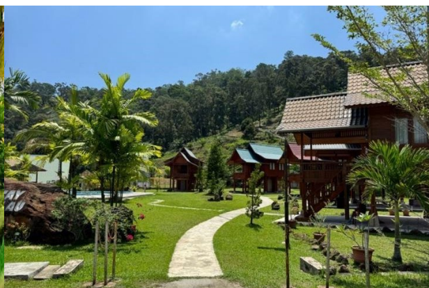
Figure 1(b): Homestay Relau