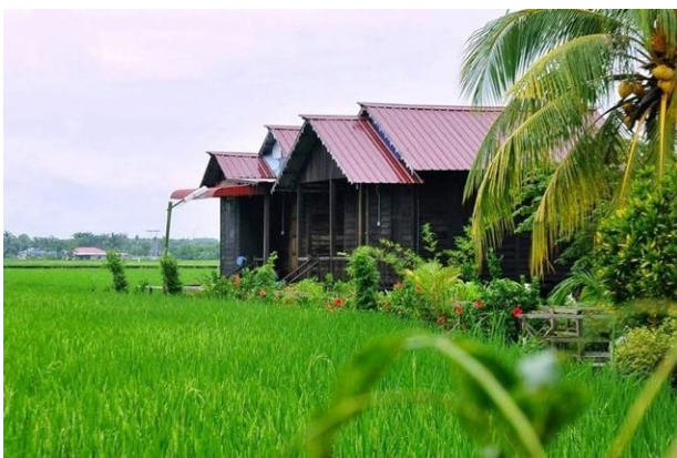
Figure 1(a): Homestay Sg. Hj. Dorani

In conclusion, homestays in Malaysia foster meaningful cultural exchanges while ensuring guests experience authentic local lifestyles and traditions, thereby contributing positively to the local economy and community (Salleh et al., 2019; Su et al., 2020). Figure 1(a) and figure 1(b) are examples of serene homestay in Homestay Sg. Hj. Dorani and Homestay Relau.