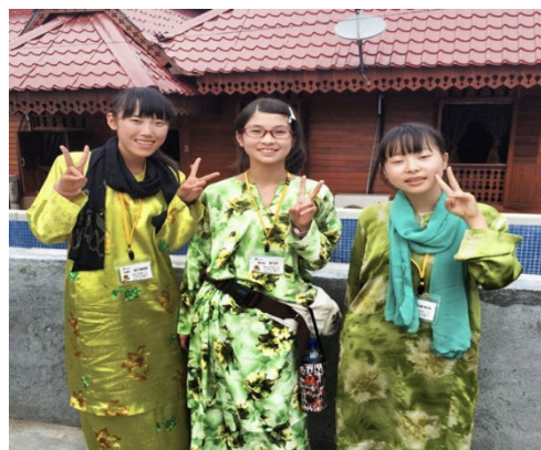
Figure 3: Traditional Malay attires

In summary, Malay Muslim homestays offer an enriching experience that fosters cultural exchange and appreciation of Islamic values. They emphasize ethical practices like waste reduction and environmental care, enhancing tourists' understanding of Islamic social responsibilities (Abdullah et al., 2020; Zamzuki et al., 2023; Bsoul, 2022).