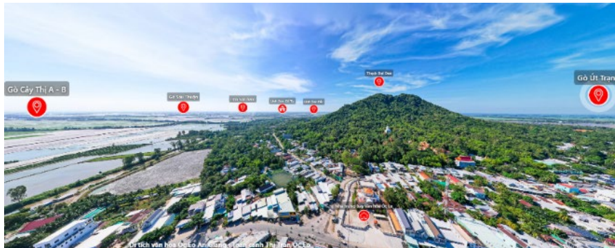
Fig.5. Panoramic View of Archaeological Sites at Ba The – Oc Eo through VR 360 TOUR