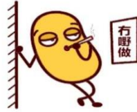
Figure 1: Emoticons“冇嘢做”

of someone. In Cantonese dialect, "呢" is used to ask a question or to emphasize; "啦" is used to express affirmation or emotion; "咩" is used to question or inquire. The use of these inflections and exclamations makes Cantonese more vivid and infectious when expressing emotions. Cantonese intonations and exclamations play a crucial role in expressing emotions. Although these words do not express specific meanings, they can convey the speaker's emotional attitude and tone of voice.