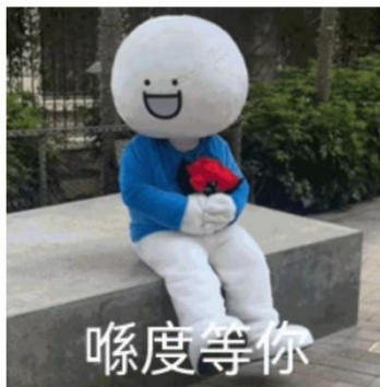
Figure 2: Emoticons“喺度等你”

These linguistic elements not only enrich the connotation of emoticons, but also make them closer to the life and culture of local people. For example, some unique Cantonese words and phrases are combined with images and words to form emoticons that are easy to recognize and understand. These emoticons not only convey specific emotions and messages, but also demonstrate the unique charm of the Cantonese language. For example, the emoticon "Waiting for you at 喺度" in Figure 2 conveys the meaning of "waiting for you here" in Cantonese through the image of a waiting person. This emoticon not only demonstrates the grammatical structure and expression of the Cantonese dialect, but also reflects the cultural tradition of the people of the Cantonese-speaking region, who are hospitable and emphasize interpersonal relationships.